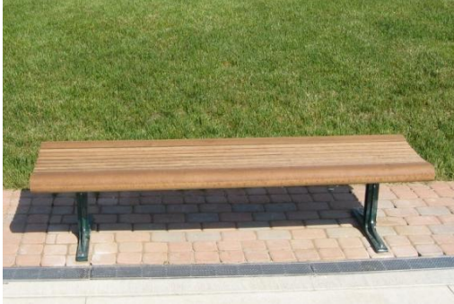
Backless Memorial Bench