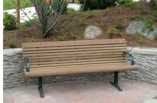
Backed Memorial Bench

The cost for the benches is subject to change. Please contact us for up to date pricing information. Prices include the bench, plaque, engraving, and shipping costs. The City installs and maintains the benches free of charge.